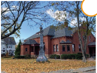
Civil War Monument