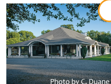
Sippican Tennis Club