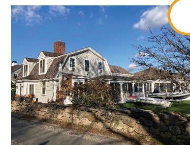
Beverly Yacht Club